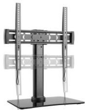
Three-level adjustable heights