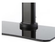
Tempered glass base