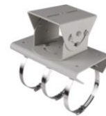
DS-1214ZJ Pole Mounting Bracket