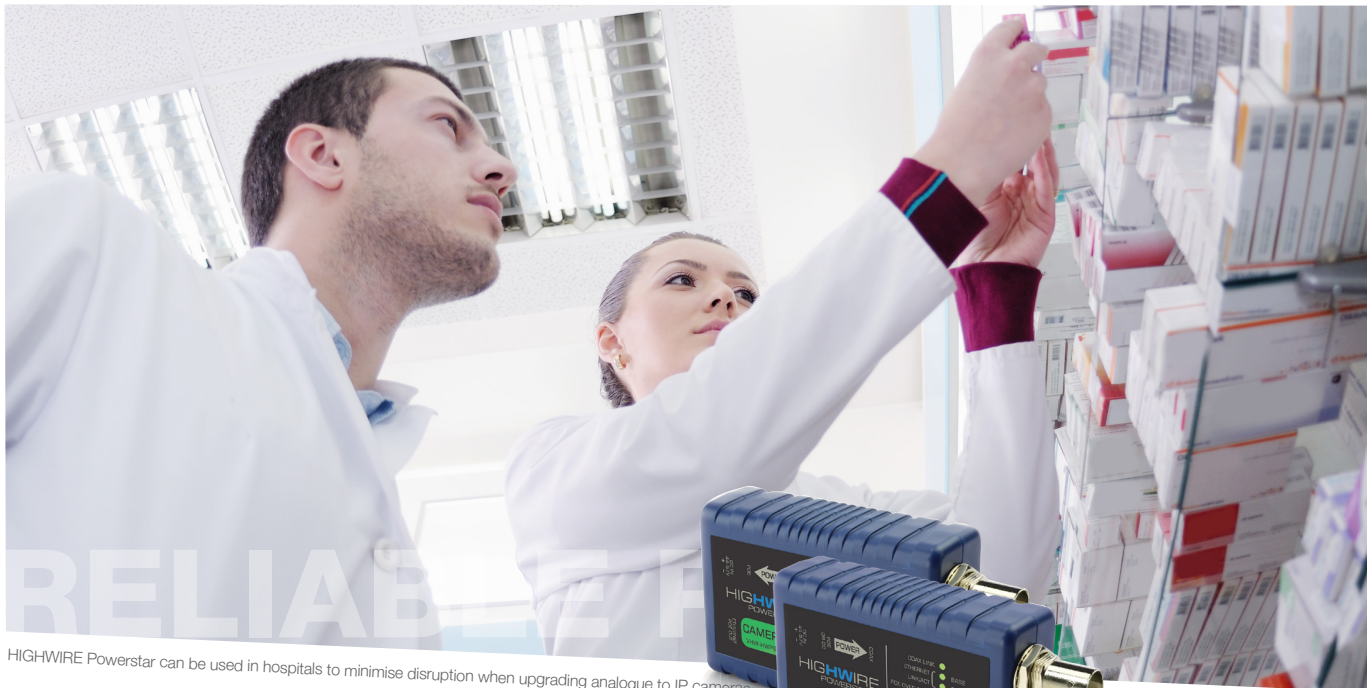
HIGHWIRE Powerstar can be used in hospitals to minimise disruption when upgrading analogue to IP cameras